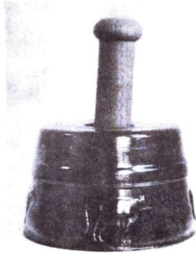
MARIGOLD CARNIVAL GLASS COW BUTTERMOLD, CIRCA 1970

AS FOR THE GLASS BUTTERMOLD REPRODUCTIONS WITH THE COW MOTIF, HERE IS WHAT YOU HAVE TO REMEMBER: MARIGOLD CARNIVAL GLASS EXAMPLES WERE FIRST PRODUCED AROUND 1970 AND THE RED ONES IN 1977. CLEAR MOLDS THAT ARE GENUINELY OLD HAVE AN OUTER PART THAT MEASURES 3 \frac{1}{8} INCHES HIGH, WHILE THE SAME PART ON THE REPRODUCTIONS IS SOMEWHAT SHORTER, MEASURING 2 \frac{7}{8} INCHES HIGH. SOME COPIES ALSO HAVE A SCALLOPED AREA THAT CAN BE FELT WHEN THE FINGER IS RUN AROUND ON THE INSIDE OF THE MOLD.