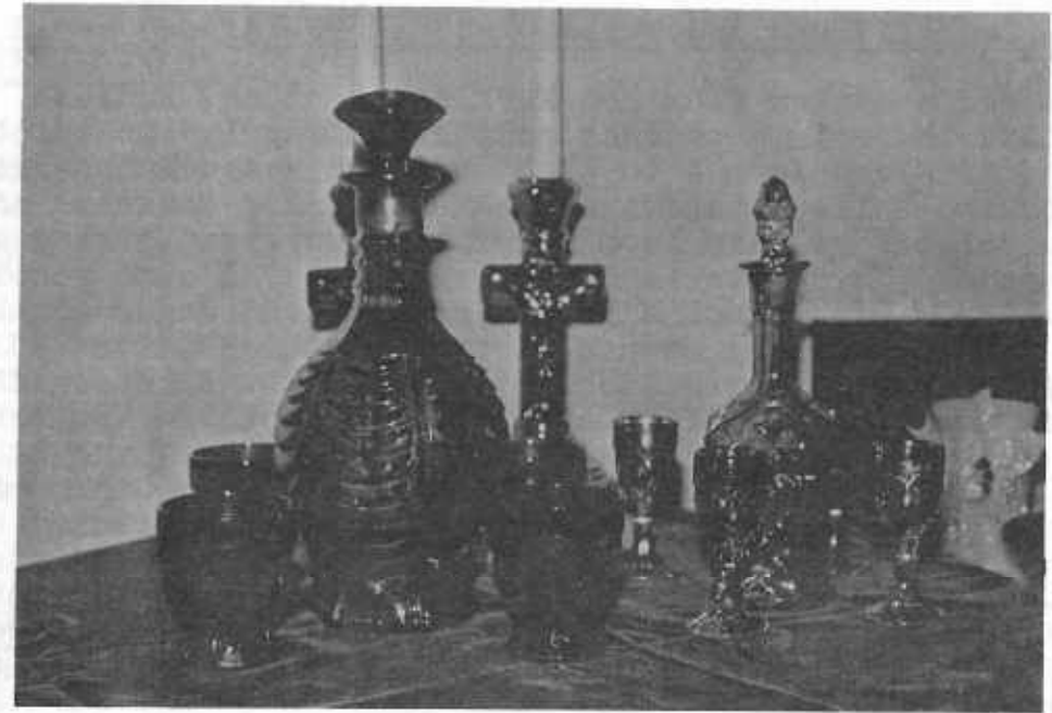
"DRAPERIE VARIANT" AND "49'er" WINE SETS