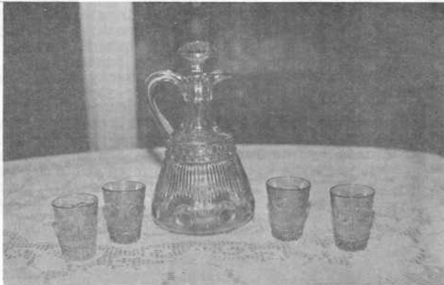
MANHATTAN PATTERN--MADE BY U. S. GLASS