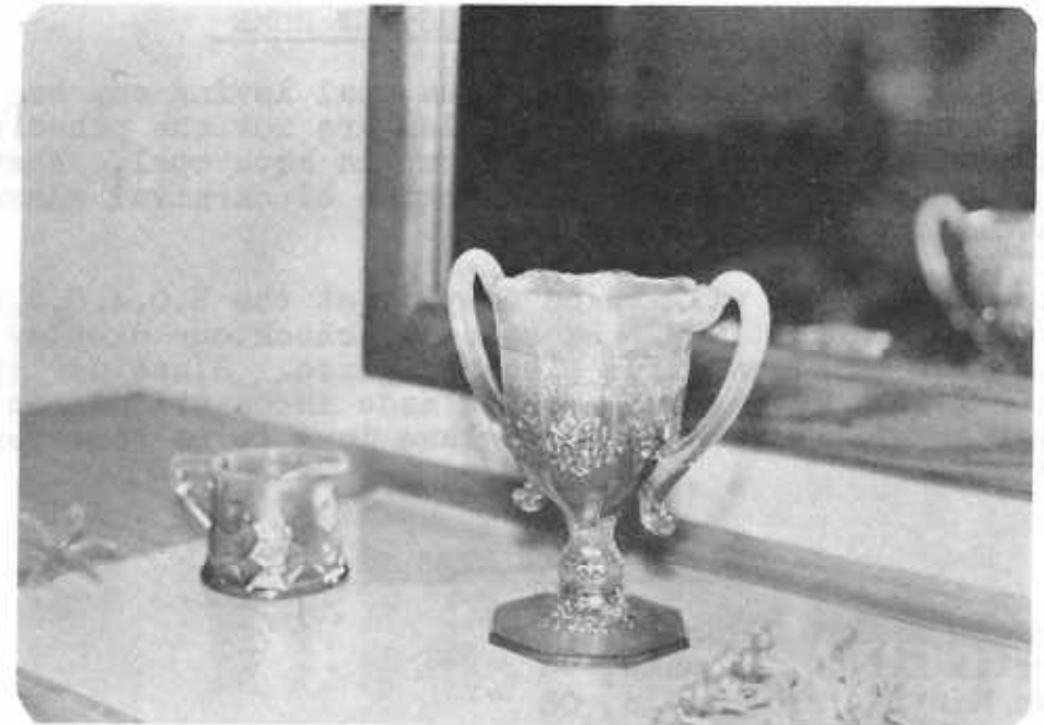
ORANGE TREE LOVING CUP IN AQUA OPAL