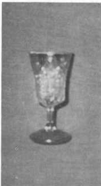
MARIGOLD PANAMA WINE