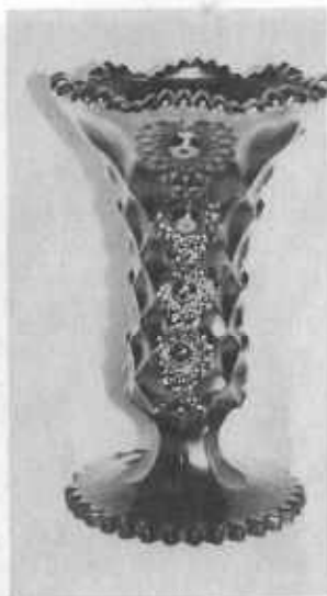
HONEYCOMB AND HOBSTAR VASE

I am very proud to be able to show this extremely rare Millersburg footed vase. Two of these are currently known, one in amethyst and the example shown in cobalt blue.