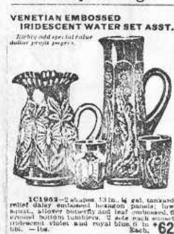
REPRINT FROM 1910 BUTLER BROS. CATALOG

Wholesale catalog for dealers at 62¢ per set of pitcher and six tumblers. Butler Brothers advertised them as their "Venitian Embossed" iridescent water set assortment. Six sets were packed in a barrel and were advertised as "Dollar Profit Makers" for their customer stores. This means they probably retailed for around $1.65 a set. Remember that this was in 1910---some 70 years ago.