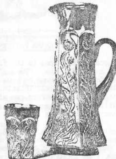
PANELLED DANDELION TANKARD AND TUMBLER

This article is No. 50 in our carnival glass tumbler series. Next month we will discuss the rare and unusual "Chain & Stars" tumbler.