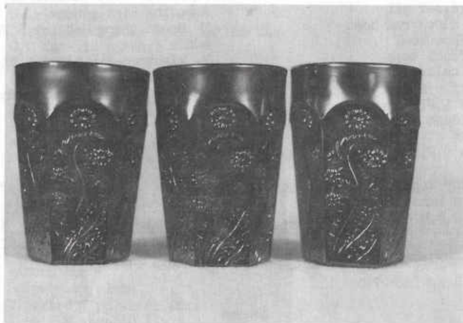
PANELLED DANDELION: NOT RARE, BUT VERY DESIRABLE

The "Panelled Dandelion" tumblers are slightly taller than most other tumblers and stand about 4 1/2 inches tall. The tumbler slopes in rather sharply to one and seven eights inches at the base. They have a top diameter of about three inches. Six arched panels surround the tumbler and each panel contains four dandelions. The base is plain, recessed and is usually factory ground around the edge.