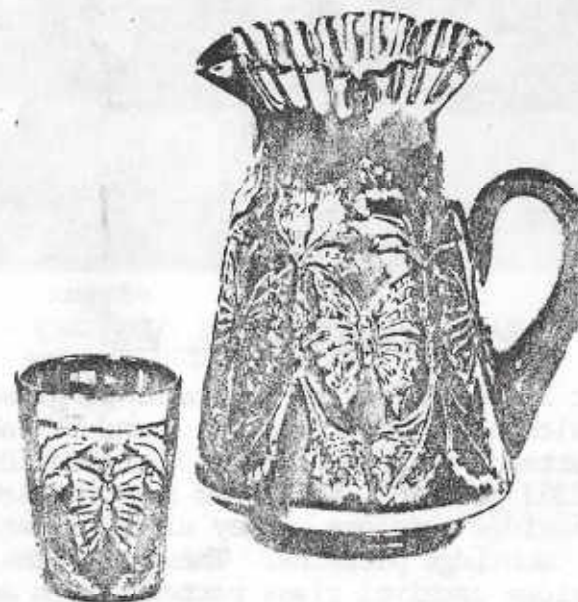
BUTTERFLY & FERN PITCHER & TUMBLER

pattern as marigold, blue, amethyst, purple, green and white. Another prominent writer also lists them in white. If white examples of these tumblers do exist, I have no actual verification of them. If any of you readers have or know of one in white, please let us know. We would certainly like to know for sure, if they really do exist in that color. Our personal favorite color in this pattern is the rich emerald green, we have this color in both styles of tumblers.