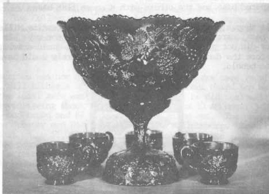
MULTI-FRUITS AND FLOWERS

Ray Notley 29 Windsor Road Wanstead London, England E11 3QU