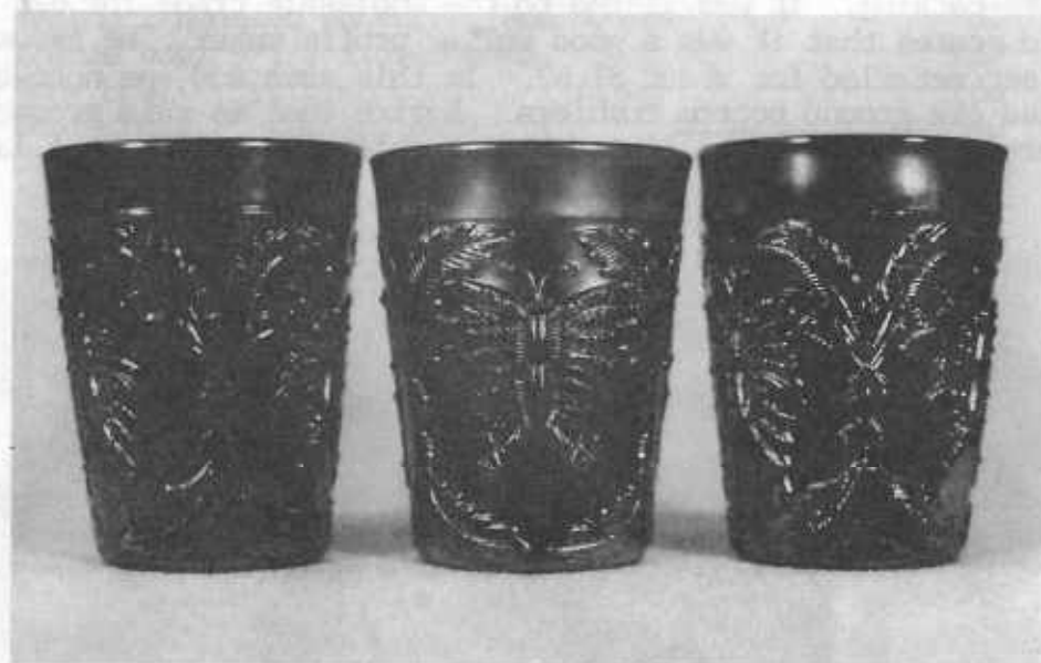
BUTTERFLY & FERN TUMBLERS WITH THE GROUND BASE