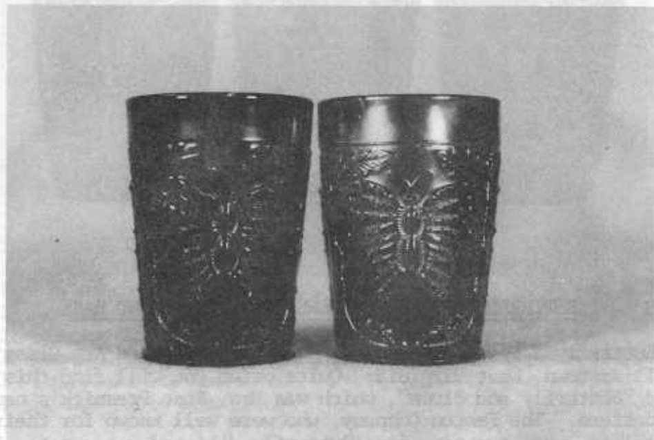
THE "BUTTERFLY & FERN VARIENT" TUMBLERS

The "Butterfly & Fern" water set was one of the earlier made carnival glass water sets, as we find it advertised in an old 1910 Butler Brothers catalog. It was listed to the wholesale trade for 62¢ per set and states that it was a good dollar profit maker. We assume the water set retailed for about $1.62. In this same add, we note the set included six ground bottom tumblers. Notice that is said ground bottom tumblers. We believe the lipped base tumblers were made at a later date.