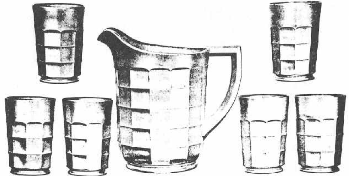
This Set consists of One 7113— \frac{1}{2} Gallon Pitcher, and Six 711—Table Tumblers.

SPECIAL LOT 2116 Contains 1 dozen 7 piece Sets, or \frac{1}{2} dozen each of two Sets illustrated.