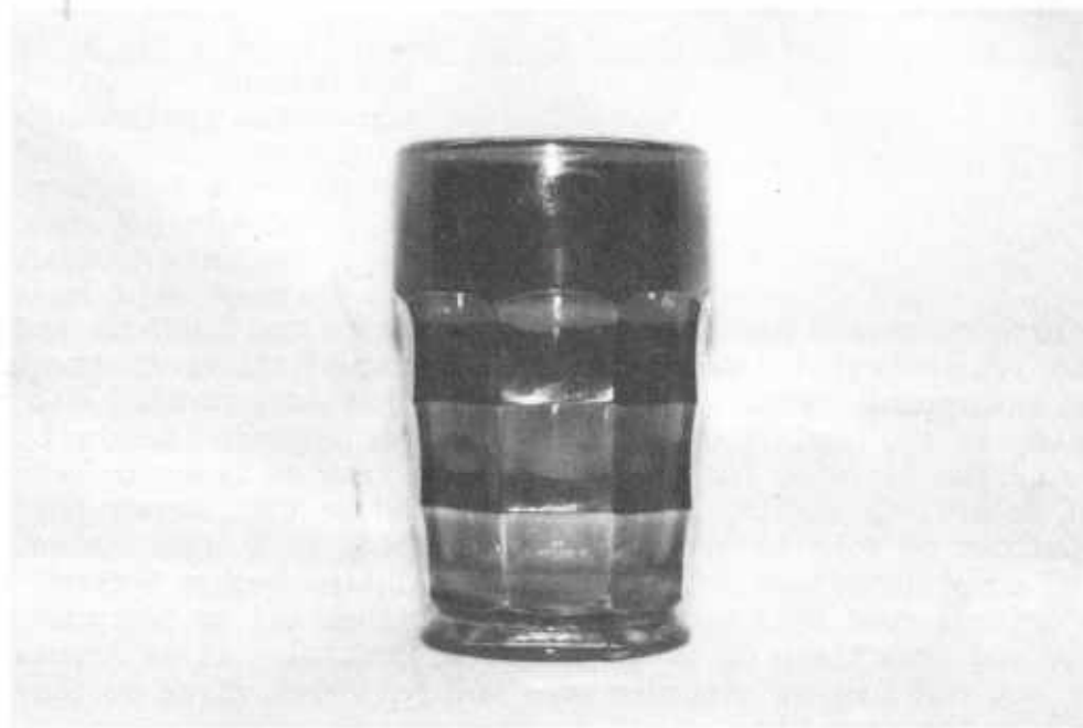
THE RANGER TUMBLER