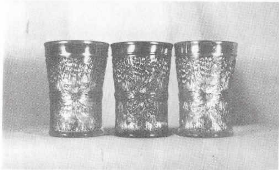
HARVEST FLOWER - ANOTHER DUGAN/DIAMOND DANDY

"Harvest Flower" tumblers are shown above in marigold, purple and an unusual light green base glass with marigold overlay. The design on the pattern was made to appear much like a bundle of wheat that has been tied in the center by hand. Wild flowers and clover are in front of the sheaf of wheat which combines to make a very appealing and interesting pattern. The tumbler varies from 4.125" to 4.25" tall and has a plain or smooth base. The top and bottom of the tumbler flare out somewhat to give the effect of the sheaf of wheat. Marigold tumblers are somewhat scarce, but you should have no trouble finding one for your collection. They may vary from light to dark marigold. I would class the "Harvest Flower" tumbler with the light green base as rare and the purple example as extremely rare. Only four of these purple tumblers have ever been reported and one of these is chipped. They are of a beautiful deep purple color with super iridescence.