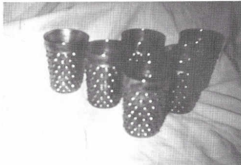
CARNIVAL GLASS BY THE BOX

Last summer an Ohio couple wrote me that they had purchased a box full of carnival glass for forty dollars. This purchase was about eight years ago. In the box was a marigold Millersburg Feather & Heart water pitcher, a marigold Blackberry Wreath bowl, a marigold Orange Peel bowl, an amethyst Beaded Cable rosebowl, a marigold Crackle waterset and a purple Northwood signed plate. This really sounds like a very good buy, but the box also contained the SIX MARIGOLD MILLERSBURG HOBNAIL TUMBLERS that are shown above. You might think about this for a minute. How many of us have ever seen that many marigold Hobnail tumblers, especially in one bunch? Probably not very many us have ever seen that many in total.