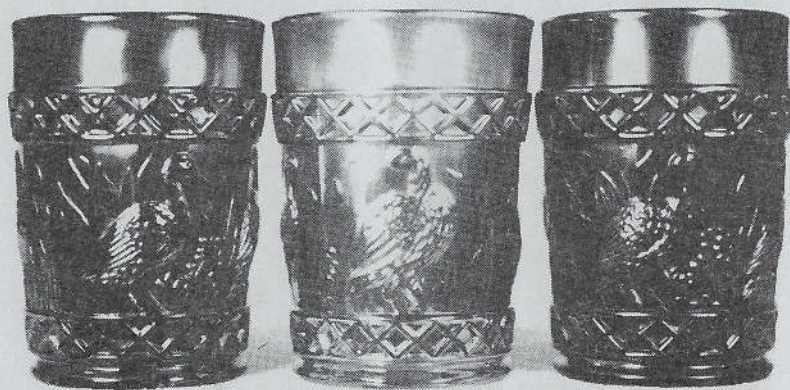
LATTICE BAND STORK & RUSHES TUMBLERS

The lattice band "Stork & Rushes" was also made in a mug. No beaded type has ever been reported in this shape, however. These banded "Stork & Rushes" mugs are common in marigold, scarce in purple and very rare in blue. Only a very few of these have been reported in blue. We have also seen a few of these mugs in lavender. They are very rare in that color.