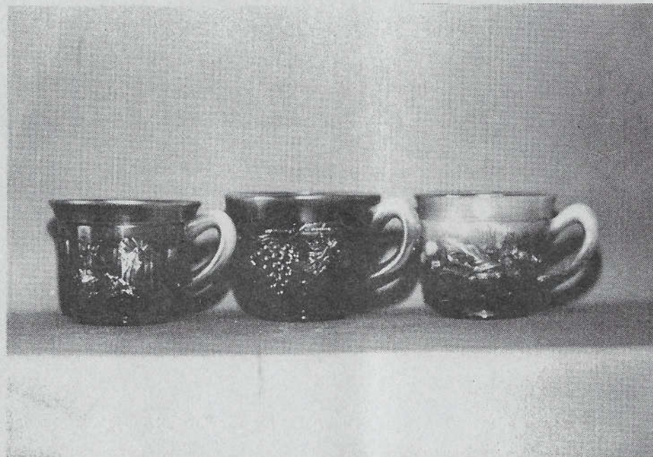
NORTHWOOD AQUA OPAL PUNCH CUPS

The above photo shows aqua opalescent punch cups in three Northwood patterns. They are "Peacock at the Fountain", "Grape & Cable" and "Acorn Burrs". All of them contain the famous underlined "N" in a circle. To the best of our knowledge, they are the only three punch set patterns that were made in the aqua opal color. While "Memphis" punch cups can be found in ice blue, ice green and white, we have never heard of an aqua opal punch bowl or cup in that Northwood pattern. We consider punch cups in the aqua opalescent color as being very rare. They are much harder to find than are such aqua opal pieces as Dandelion mugs, Peacocks on the Fence eight-ruffle bowls, Hearts & Flowers compotes, Fruits & Flowers bon bons, Daisy & Drape vases, Beaded Cable rose bowls and Leaf & Beads rose bowls. It took us ten years to find and put these aqua opal cups together for our collection. We are quite sure that these three punch cups are as close as we will ever come to owning an aqua opal punch set.