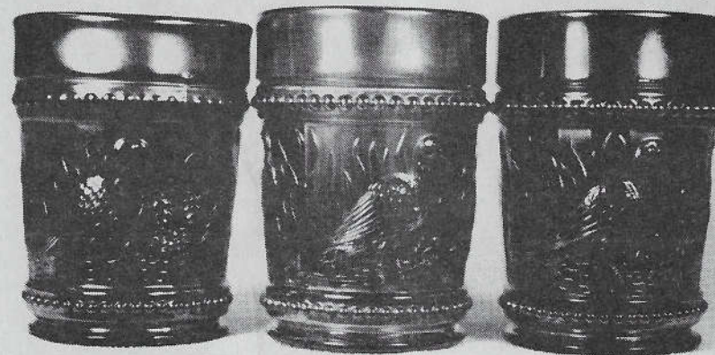
THE BEADED STORK & RUSHES TUMBLER

The "Stork & Rushes" is a pattern that is considered to have been made by the old Dugan Glass Company of Indiana, Pennsylvania. It is interesting to note that this pattern was made in two different type patterns. One of these is beaded, much like the Peacock at the Fountain tumblers, with a row of beads circling the tumbler at the bottom and another near the top. The second version has a lattice band that is used at the bottom and again one near the top. Photo #2 shows these lattice band tumblers very well. Photo #1 illustrates the beaded type of tumblers.