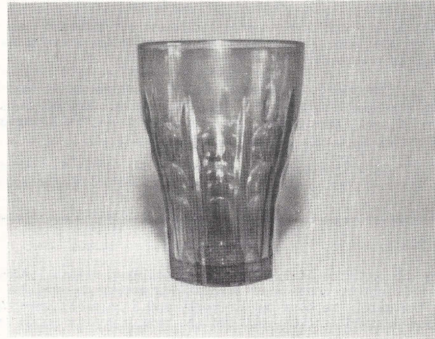
THE SWORD AND CIRCLE TUMBLER