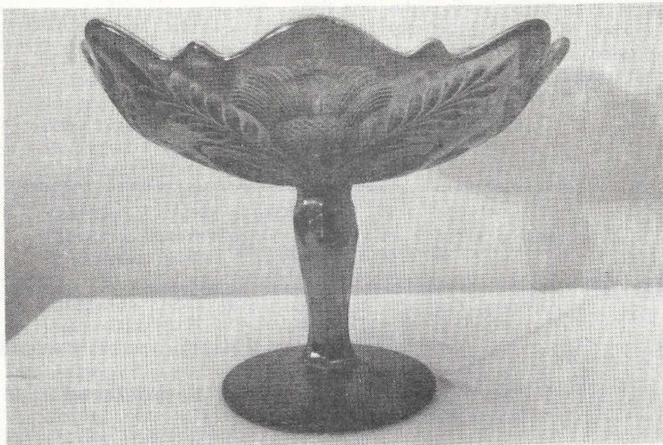
LARGE INVERTED THISTLE COMPOTE IN GREEN