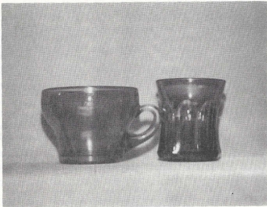
CARNIVAL GLASS BY HEISEY

It is our understanding, with information given us by authorities on the subject, that Heisey did not make any carnival glass. Heisey people claim that the Heisey signed pieces, that have iridescence, were made by Heisey and iridised by someone else. We certainly respect their knowledge on this subject. We do own a few pieces of Heisey signed carnival glass, however, and have seen a number of others with iridescence that contained the Heisey trademark. This trademark consists of a capital "D" inside a diamond.