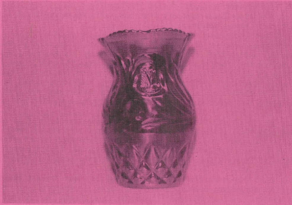
THE WESTERN THISTLE VASE