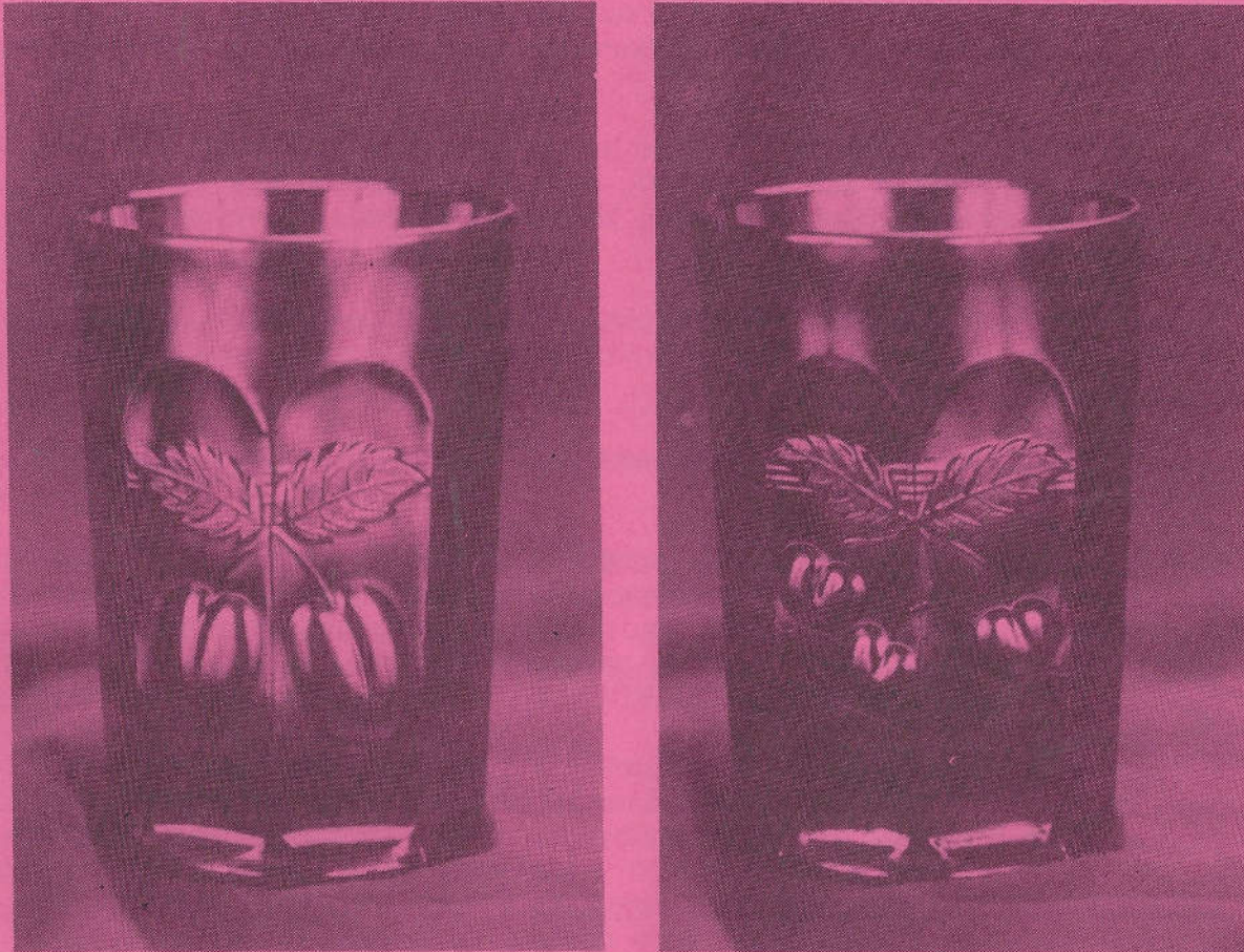
NORTHWOOD'S PLUMS & CHERRIES TUMBLER

The Plums & Cherries tumbler that is shown above, is the only one that has ever been reported in Carnival Glass. In fact, there are only a very few pieces of this pattern that are known to exist in Carnival Glass. Another example of this pattern is a blue spooner that will be sold from the Ludeman collection at the 1990 I.C.G.A. Convention auction in July.