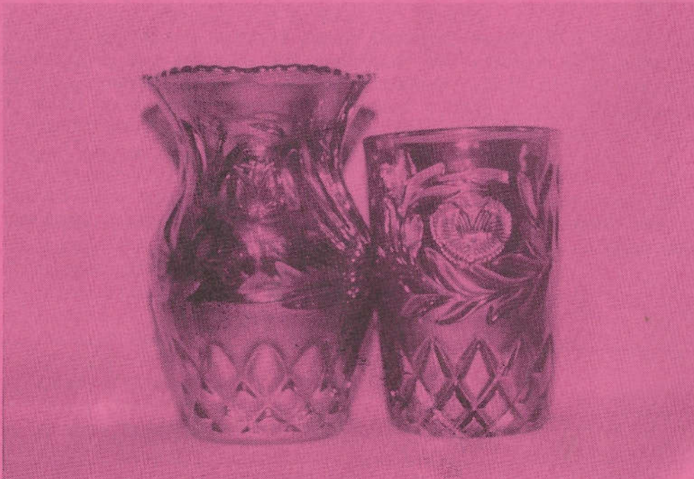
THE WESTERN THISTLE VASE AND TUMBLER