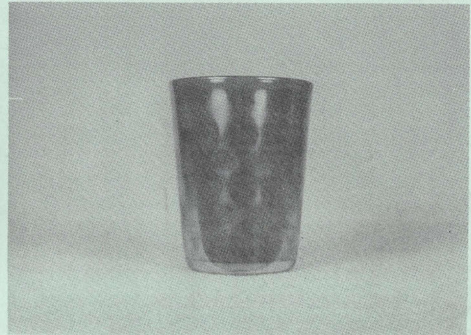
INVERTED COIN DOT TUMBLER BY NORTHWOOD

We believe that these six rowed Inverted Coin Dot tumblers were made by Fenton, even though we have not been able to find it in their old advertising material that we have seen.