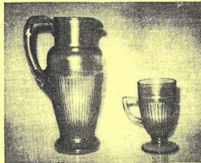
ADAMS RIBS PITCHER AND TUMBLER

We might add that we have a Coin Spot goblet, an old Dugan pattern, in this same Florentine green color. It too, was made by Diamond at about the same 1925 era. It also will glow over the entire piece when it is held under a black light. We consider this florentine Coin Spot goblet as quite rare.