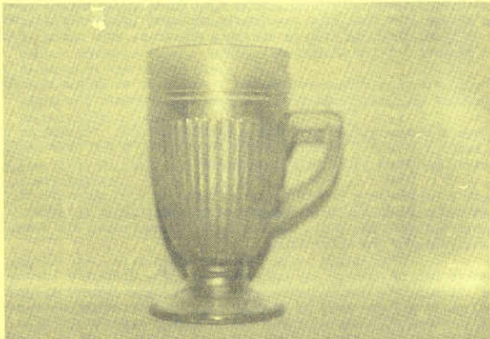
THE ADAMS RIBS TUMBLER

The Adams Ribs tumbler, that is shown above, is in a pretty shade of pastel green. This color is properly called Florentine green, a name that was used for this color by the manufacturers of Carnival Glass back when the pieces were made. This is the only color that we have seen in this tumbler. Perhaps it was made in other colors, such as celeste blue, but we have not seen them. This tumbler will really glow from bottom to top when held under a black light. The iridescence is very nice. It is a little over 5 inches tall and was sold as a lemonade or ice tea tumbler. Some people refer to this handled tumbler as a mug, but that is not correct. There is a tall pitcher that goes with these tumblers to form a complete set. We are showing the pitcher and one tumbler in the second photo. Note that the tumbler has the exact ribbed pattern as does the pitcher. This tumbler, along with some other pieces in this pattern, is shown on page 393 of Hazel Marie Weathermans "Colored Glassware of the Depression Era 2". Note that she refers to this pattern as Adams Ribs. We have noticed that one of these Adams Ribs tumblers is displayed in the Fenton museum in Williamstown, West Virginia.