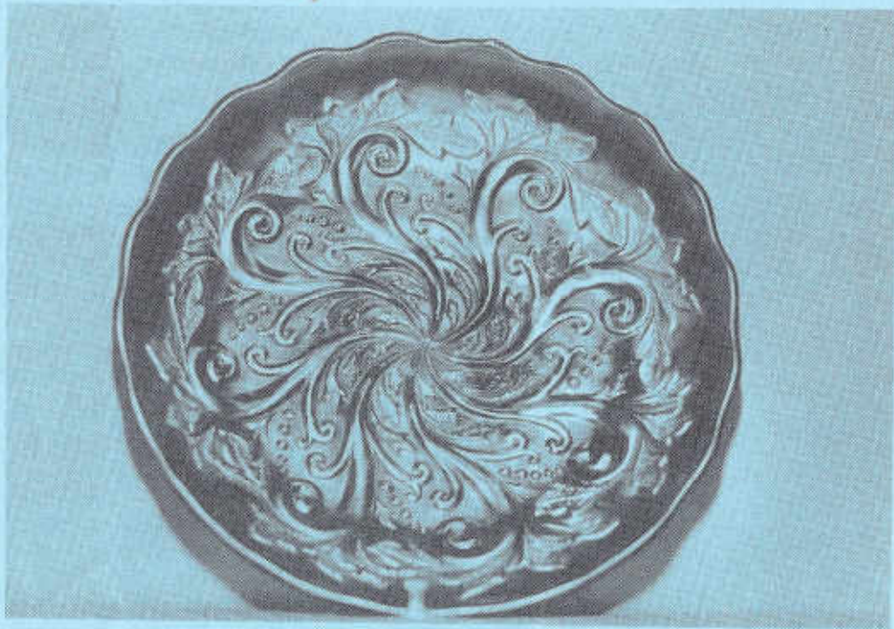
SEAWEED ICE CREAM SHAPED BOWL IN GREEN

The very graceful Seaweed pattern was made by the old Millersburg Glass Co. of Millersburg, Ohio. We consider it as one of the scarcer Millersburg patterns. Any piece in this pattern is really not easy to find. The I.C.S. bowl shown above is in the 10" size with super color and radiant iridescence. It has always been one of our favorite Millersburg pieces. You really need to see this piece to realize how beautiful it really is. Even though this is not the rariest size in this pattern, we consider them very rare in the ice cream shape. We have seen or heard of only 6 or 7 in this shape. The colors known in these 10" ice cream bowls are marigold, green, amethyst and we have seen one in blue.