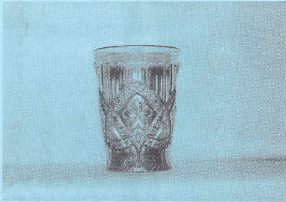
THE MARIGOLD FLOWER MEDALLION TUMBLER

This unique and very interesting Carnival Glass tumbler is called Flower Medallion. This pattern can be found in Kamm book 5, page 147, but no mention is made of the maker of this pattern. It is also shown in the McCain pattern glass primer, but it too, does not mention the maker.