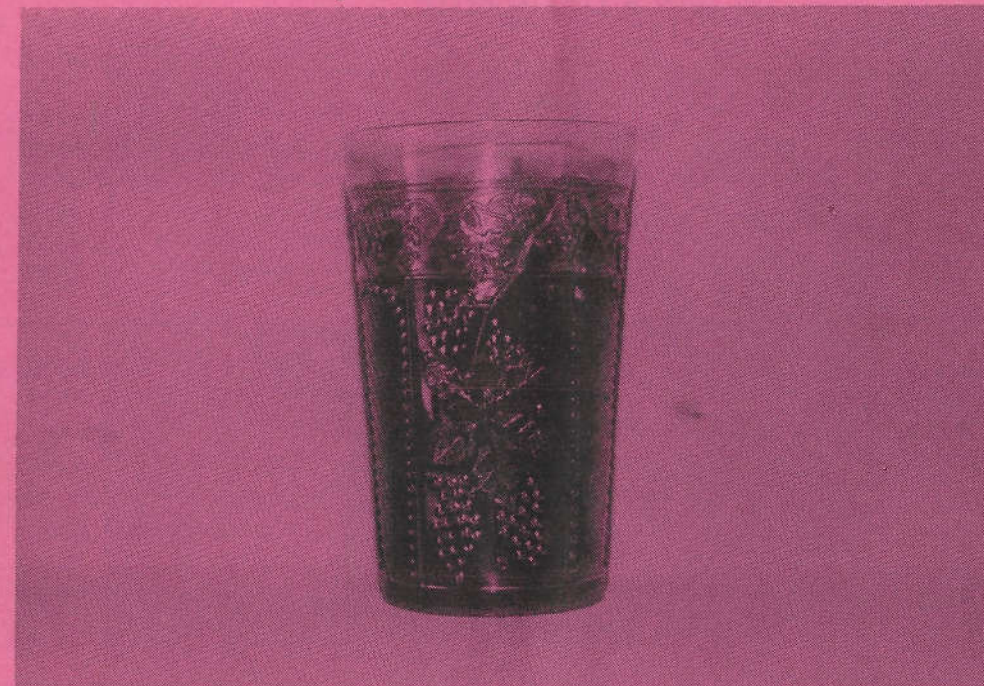
THE BEADED PANELS AND GRAPES TUMBLER

Here is a tumbler that is very similar to the Muscadine tumbler that was recently featured in this series. This tumbler is somewhat shorter than the Muscadine, standing 4\frac{1}{2} inches tall. It is 2\frac{3}{4} inches across the top and with a base diameter of 2 inches. The underside of the base is plain. On the outside surface of the tumbler are 3 panels featuring bunches of grapes and leaves and 3 panels that are bordered with beads. Near the top is a band of grapes and leaves that circles the tumbler. On the Muscadine tumbler, this upper band contains a series of diamonds and squares. With the exception of the height of the tumblers, this upper band is the main difference between these two tumblers.