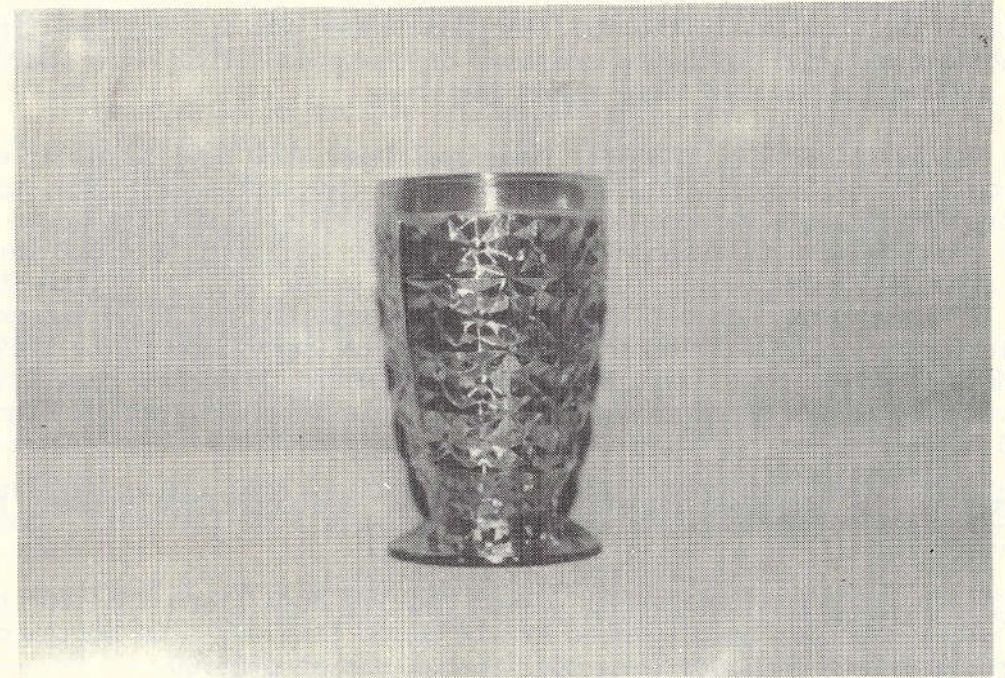
THE STUDS TUMBLER