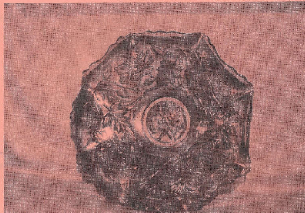
UNUSUAL AND RARE NORTHWOOD BOWL