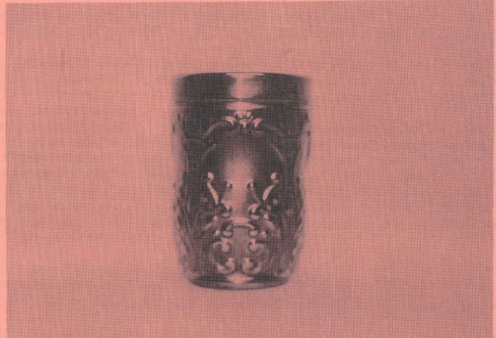
THE GRACEFUL TUMBLER IN BLUE

This beautiful Graceful Carnival Glass tumbler was named by Al Rodenhouse in honor of Grace Rinehart, a well-known and very active Carnival Glass collector. While it is true that there is another Carnival Glass pattern named Graceful, it was made only in a vase. These two patterns are very different from each other and there should be no confusion between the two distinctively different patterns with the same name.