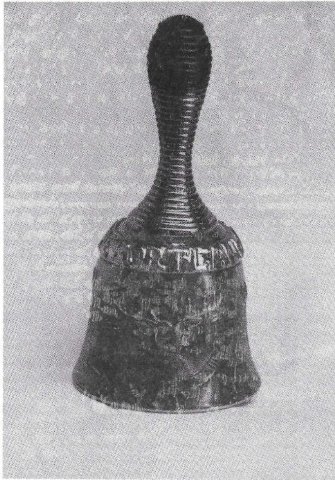
PHOTO #1 1912 PORTLAND, OREGON ELKS BELL SHOWING THE WORDS CITY OF PORTLAND

The 1912 Portland, Oregon Elks Bell is the first one that has ever been reported, to the best of our knowledge. We show it here from two different positions which points out the date of 1912 and also the name of Portland. We have owned several of the 1911 Atlantic City B.P.O.E. and 1914 Parkersburg B.P.O.E. Bells, but until 1991, we had never seen or heard of the 1912 Portland, Oregon example. It is made very similar to the other two Elks Bells, so it is most likely that this one was also made by Fenton.