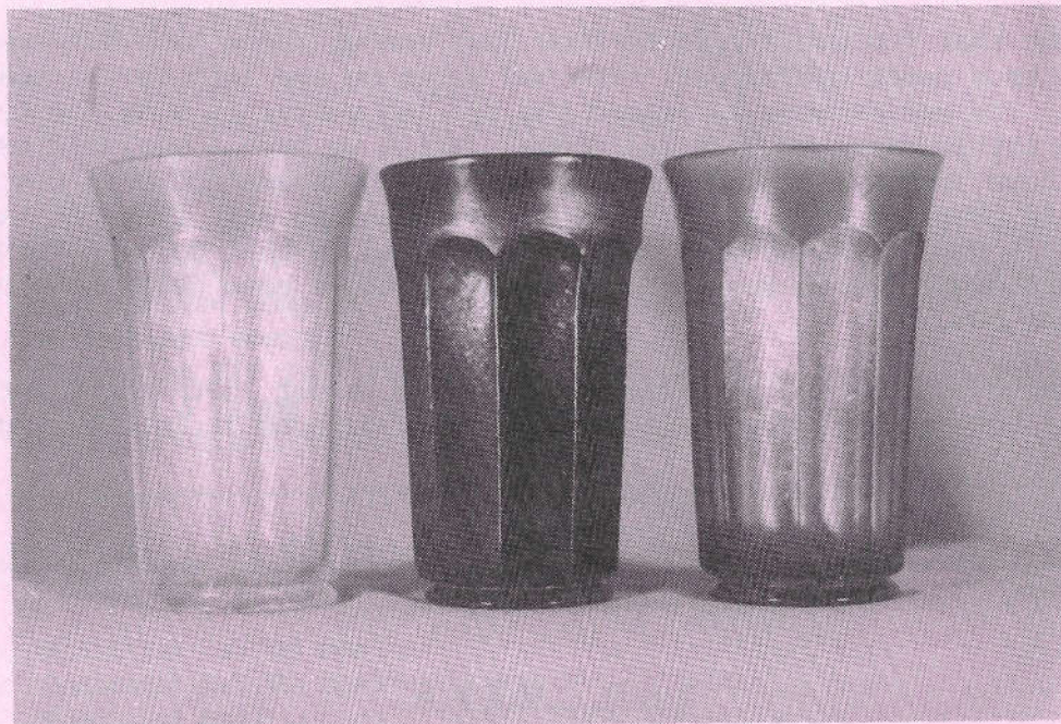
COLONIAL STRETCH TUMBLERS

These beautiful Colonial Stretch lemonade size tumblers were made by the Imperial Glass Corporation of Bellaire, Ohio. They are somewhat taller than the regular table size tumblers measuring 5\frac{1}{4} " in height, 3\frac{1}{2} " across the flared out top & have a base diameter of 2\frac{1}{4} ". The tumblers have the typical collar type base that was used so often by Imperial. A sixteen point star is impressed into the bottom of the base. There are nine panels that go around the tumbler, three in each of the three part mold.