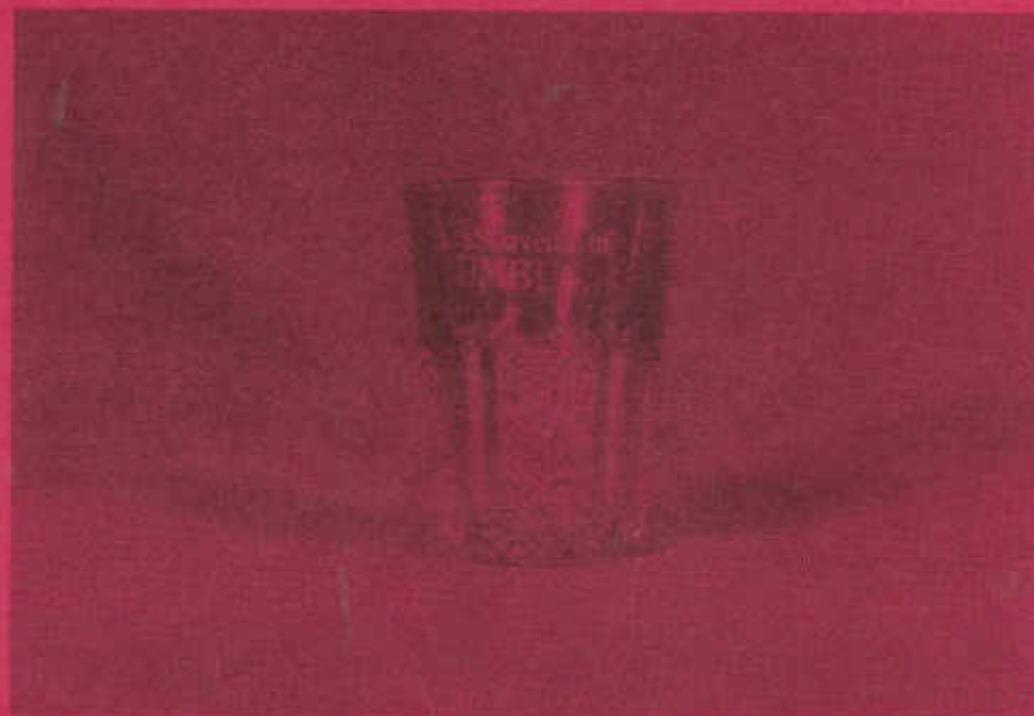
THE RAINBOW CHAMPAGNE TUMBLER

This cute little tumbler was made by the old McKee Glass Company. Rainbow was their original name for this pattern. McKee made very little iridised glass, this being the only tumbler that we know of in this pattern. A few other McKee patterns where iridescent pieces are known to exist are Aztec, Martec, Majestic, Sunbeam, Heart Band, Cuba, O'Hara and Puritan. We are sure that there are others, but these McKee patterns are some that we own or have owned over the years. A number of these pieces are signed with the PRESCUT trade mark. PRESCUT is the popular trademark of the McKee Glass Company.