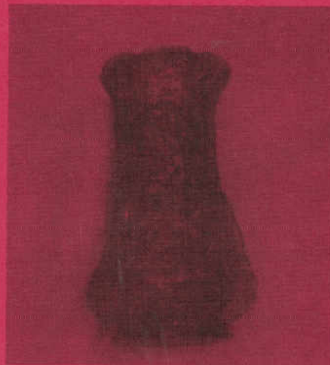
RARE WISTERIA VASE IN GREEN

This beautiful Northwood Wisteria vase is 10½ inches in height. It measures 5 inches across the top and 4½ inches in diameter at the base. The color is green with outstanding blue and purple iridescence on both the interior and exterior. There is a blank space on the vase where the handle was to be applied. In other words the vase was made from the water pitcher mold with the handle never applied.