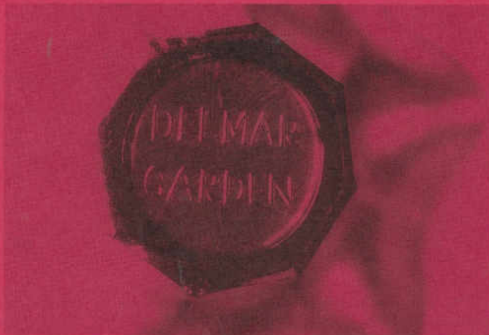
PEACOCK TAIL PATTERN DELMAR GARDENS ADVERTISING BOWL

From 1903 to 1910, Delmar Gardens was the feature attraction in Oklahoma City. It covered 140 acres and contained an amusement park, 1,200 seat outdoor theatre, scenic railway, dance hall, beer gardens, swimming pool, baseball park and race track.