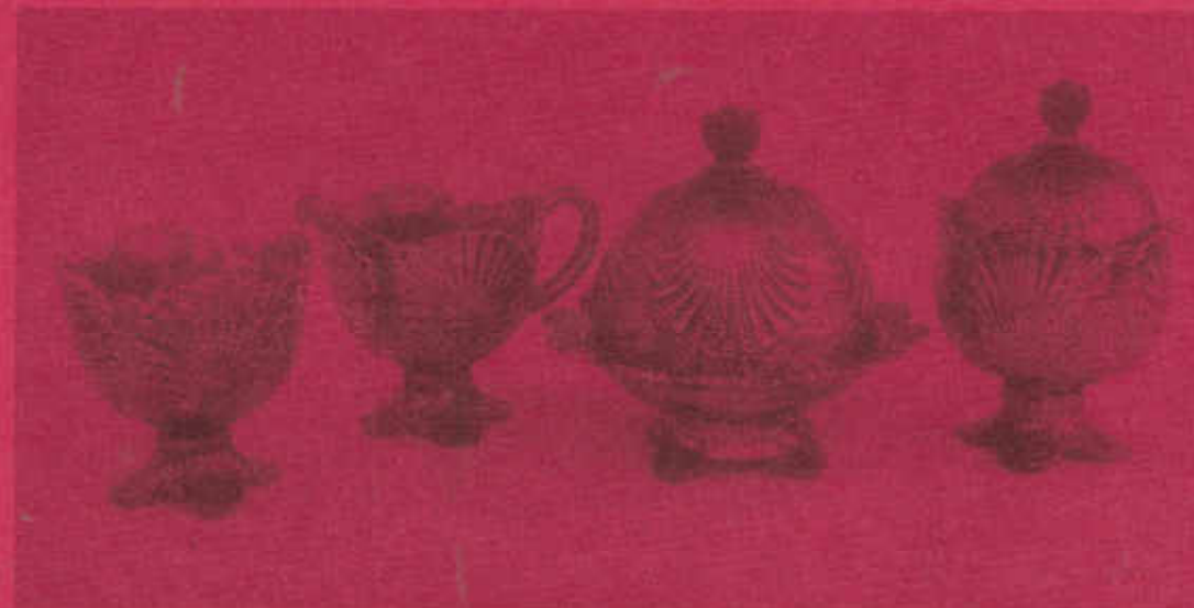
THE BEADED SHELL TABLE SET IN AMETHYST

This Dugan set was made in both marigold and amethyst. Amethyst is rare, but marigold is not seen every day either. The shape of the pieces in this set is certainly different. It is hard to imagine a set that was to be used every day resting on such an unsecure footing which resembles a four-toed foot extending from a stubby stem. The creamer reminds me of an awkward ugly duckling. Stretching our imagination, we might see the body of a modern broad-breasted turkey that can't fly or can hardly walk when we look at the bulging design of the sugar.