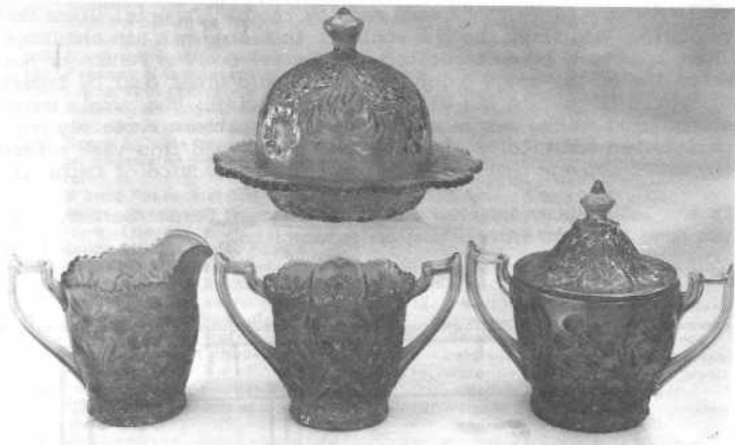
THE COSMOS & CANE TABLE SET

This is considered a U. S. Glass pattern and is listed in honey amber, marigold and white with all colors being scarce. We rarely see a piece in what we call dark marigold, so we wonder if marigold and honey amber are not used interchangeably. We are a little partial to the soft honey-marigold color that is referred to as honey amber. This color is unique in our Carnival Glass. The white color is usually a frosty white that is a good companion to the honey amber.