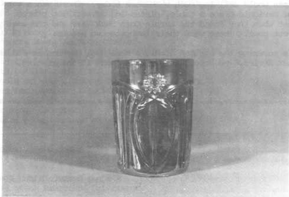
HOBSTAR AND SHIELD TUMBLER

The Hobstar and Shield tumbler is somewhat smaller than most other Carnival Glass tumblers that we have seen. Most American made water tumblers are usually four inches high or slightly more than that. The Hobstar and Shield example stands only 3 5/8 inches high with a top opening of 2 5/8 inches. The base is 2 1/4 inches in diameter. It is slightly depressed and smooth on the underside. The outer 1/8 inch edge of the base has been factory ground and nicely polished.