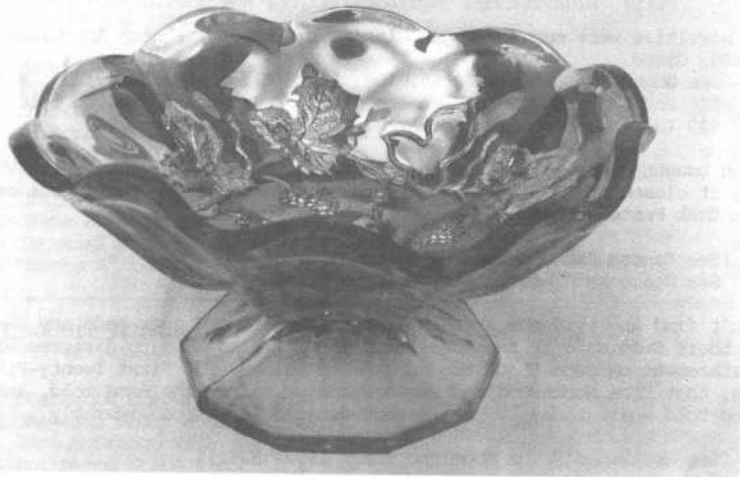
CASE OF THE ABSENTEE LEAF STRAWBERRY WREATH

The four compotes known to display one leaf without stippling may be forerunners to the ruffled compotes in that pattern which we find in amethyst-lavendar, marigold, green, with all leaves stippled.