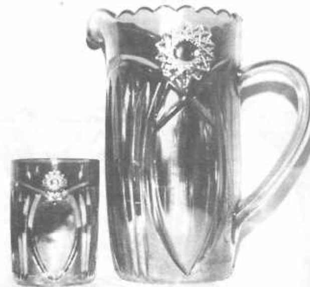
HOBSTAR AND SHIELD SHOWING THE WATER PITCHER