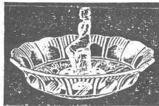
"FLORA" 10" BOWL AND FIGURE. Made in Amber, Blue, Green and Rosalin. Acid finish.