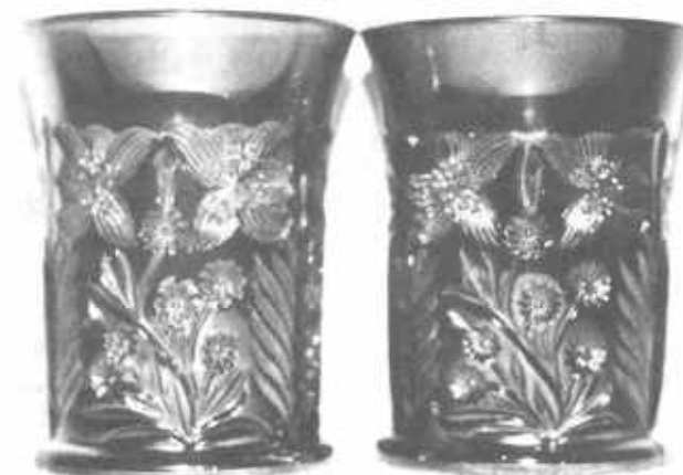
TIGER LILY VARIET IN MARIGOLD AND BLUE

The foreign made copy, known as Tiger Lily Variet, also should be updated. It is shown in the photo on the next page in both marigold and blue. We once