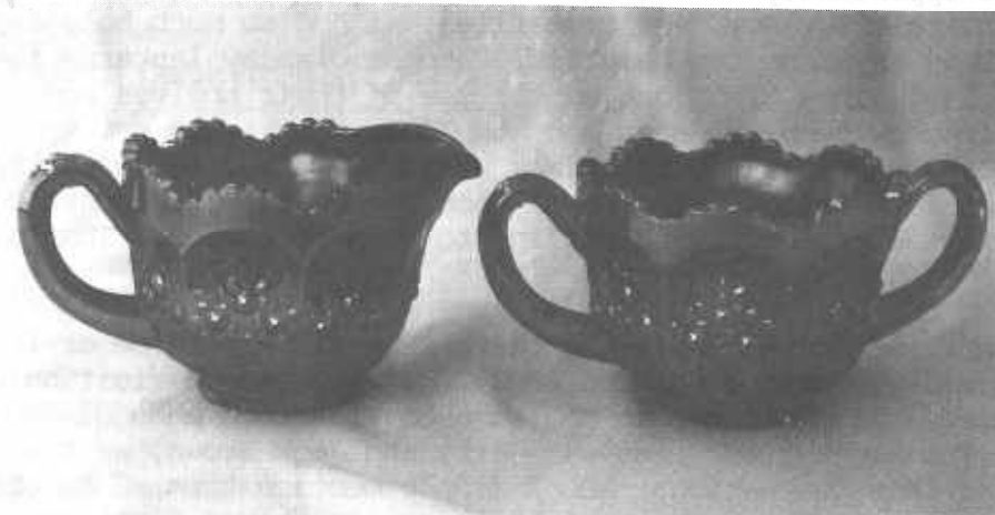
THE ORANGE TREE BREAKFAST SET

In the August, 1993 H.O.A.C.G.A. Bulletin we pictured and four piece "Footed" Orange Tree table set, as it is sometimes called. Now we are showing the Orange Tree breakfast set. This is a Fenton product and was made in marigold, amethyst, green and white. There are several differences in the sets, but the most noticeable is the absence of the "leaf bracket" feet, as Mrs. Hartung called them, on the breakfast set. Like most breakfast sets it is a two piece set and each piece is smaller than its four piece big brothers. For example, the breakfast creamer is 3 1/4" tall while the regular creamer is 4 3/4" tall and their shapes are quite different. The sugar has handles and no lid or cover (there is no lid for the cover to rest on). Both pieces in this set have collar bases.