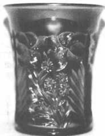
IMPERIAL TIGER LILY IN TRUE AMBER

We wrote about Imperial's Tiger Lily tumblers and the European copy called Tiger Lily Variet in September, 1979. Since that time there has been a few important changes to report in these patterns. Colors provide the most important changes. In the Imperial Tiger Lily tumbler we can add another color to the list reported in our 1979 article. Two very pretty and rare amber Tiger Lily tumblers are now known to exist. One of them is illustrated in the above photo.