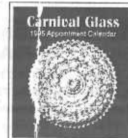
Cover of the appointment book showing a white Persian Gerc on chop plate by Dugan

per order (regardless of how many you purchase). Order now for holiday gift giving from PageWorks, Box 14493, Chicago, IL 60614.