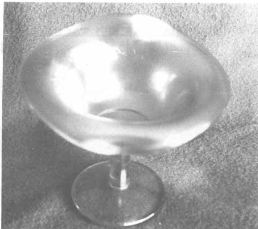
ROSE SPRAY COMPOTE

This small compote made by Fenton is presented to us in at least a couple of shapes. In addition to the graceful jack-in-the-pulpit shown in this picture, once in a while, the sherbet type makes an appearance.