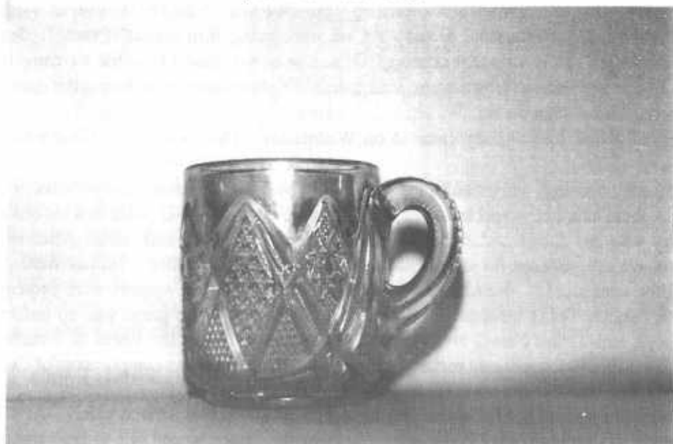
THE MINNESOTA MUG

At an I.C.G.A. convention in Indianapolis, Indiana, we were asked to discuss the different mugs that were brought in for the convention display room. Some of you might remember that we brought along the unusual mug that is shown above for that display. At the time, we did not know the name of the pattern. We had purchased it a short time earlier hoping to find out the name and maker of the pattern.