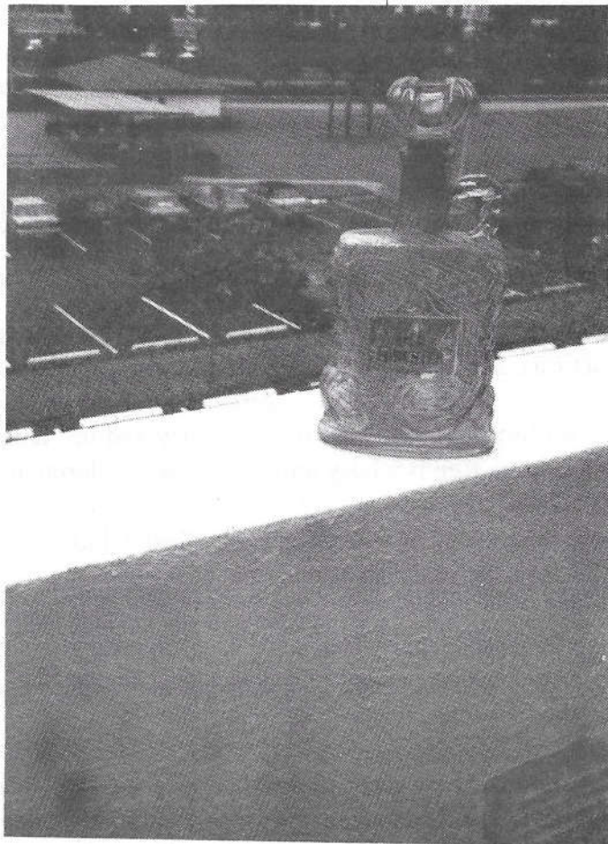
Rudy Kovacs of Pembroke Pines, Fl sent in a picture of his marigold Old Forester decanter. It has a gorgeous overall swirl design. It is very unusual to see one in marigold.