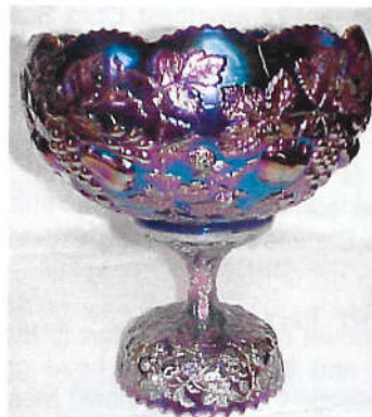
Blue Millersburg Multi Fruits and Flowers Punch Bowl