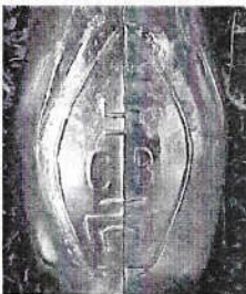
The letters CB and the swastika are fairly clear

The two trademarks known are rather interesting. Below the swastika on most examples of the Elephant vase, are the letters JAIN. However, on some examples, the letters CB can be found. We are not yet certain what these letters stand for - another factory, a line made for a specific outlet, or something else?