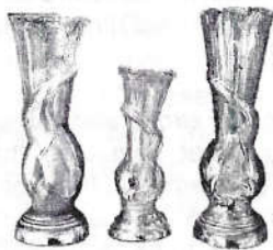
Two different sizes, and two different ways to wind the trunk!

The Elephants certainly go in TWOs. There are two broad sizes of the Elephant vase, there are two major pattern variations and there are two trademarks known (i.e. lettering). The two broad sizes are around 9" and around 7" - there are variations either side of that. There are also two broad styles of base: the larger vase has two or three narrow rings around the base, while the smaller size has larger, melon rib type steps.