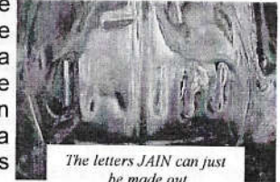
The letters JAIN can just be made out

vase. Below the trunk are two large ears; above the tiny eyes is a headdress, with detail that gives the appearance of braiding around the edge. In the center part of the headdress is usually a swastika and the word JAIN, and sometimes the letters CB.