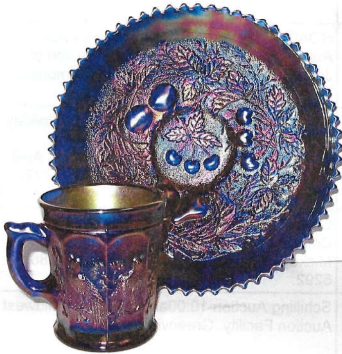
Does Stippling Make a Difference? Article By Alan and Lorraine Pickup