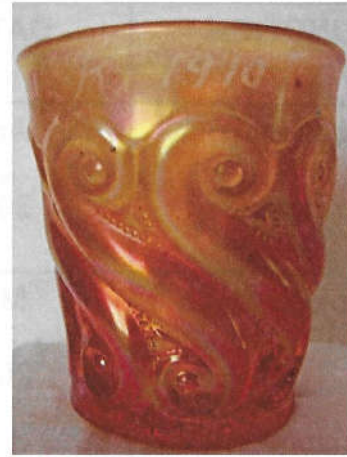
S-Repeat Article By Barb Chamberlain