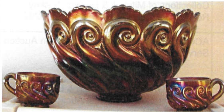
S-Repeat Article By Barb Chamberlain