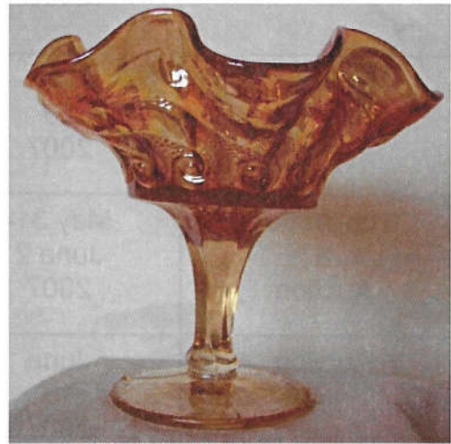
S-Repeat Article By Barb Chamberlain