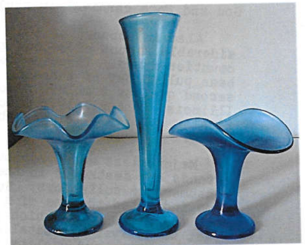
The Bud Vase Whimsey Whimsey, Pg 7 By Barb Chamberlain