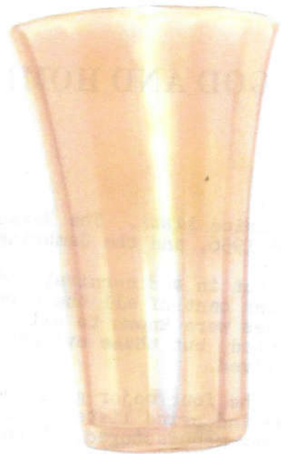
Sunshine Panels, Pg 5