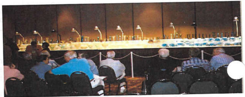
Convention Attendees enjoying looking at the Pastel Blue Carnival Glass Display at the 2008 HOACGA Convention. Thanks to Norma Strohm & Ardonna Bueher for sharing their convention pictures with our members.