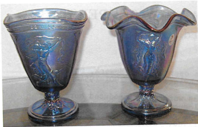
2008 Fenton Dancing Ladies Vase, Pg 4 By Brent Mochel