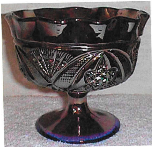
Headdress/Curved Star, Pg 6 By Alan & Lorraine Pickup