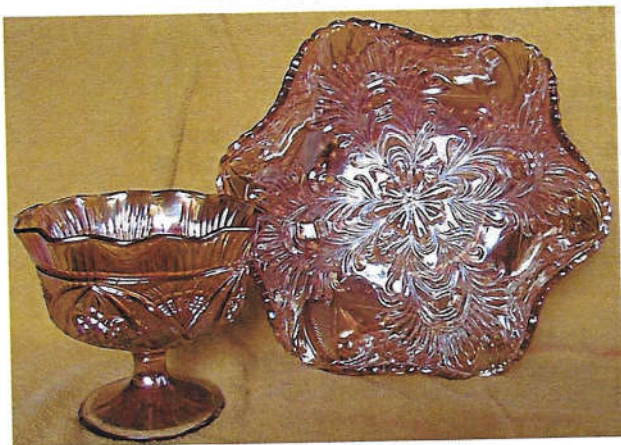
Headdress/Curved Star, Pg 6 By Alan & Lorraine Pickup