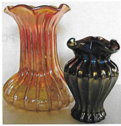
Rib & Panel Vase, Pg 11 By Alan & Lorraine Pickup