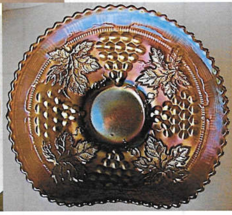
Grape & Cable Double Handgrip Variant Plates, Pg. 9 By Barb Chamberlain