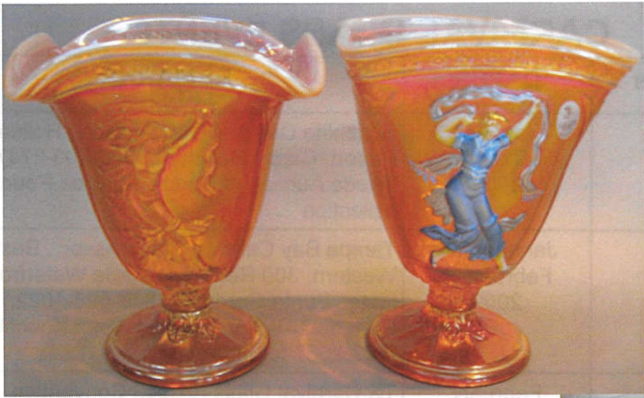
2009 Peach Opal Dancing Ladies Vase, Pg 4 By Brent Mochel