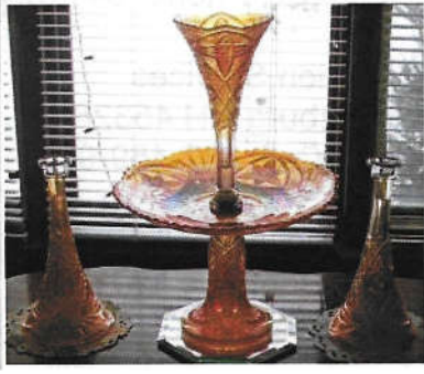
Curved Star Epergne, Pg 12 By Gale Eichhorst