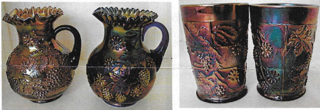
Floral & Grape - Duo Manufacturers By Barb Chamberlain Article on Page 9