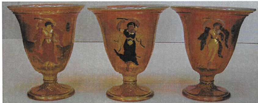
Painted Peach Opal Dancing Ladies Vases for Sale. See Page 14 for Order Form.