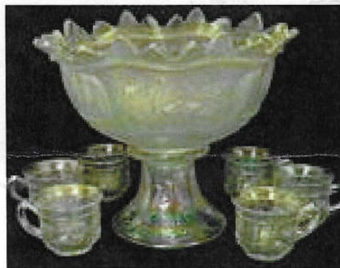
Peacock at the Fountain 8 pc. punch set in white – as nice as you can get this rare set.