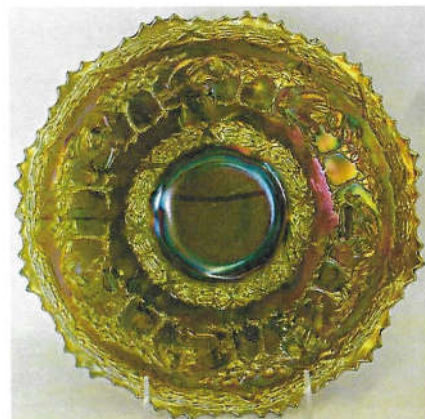
Peter Rabbit 9" plate – green – very rare and they don't get much better than this.