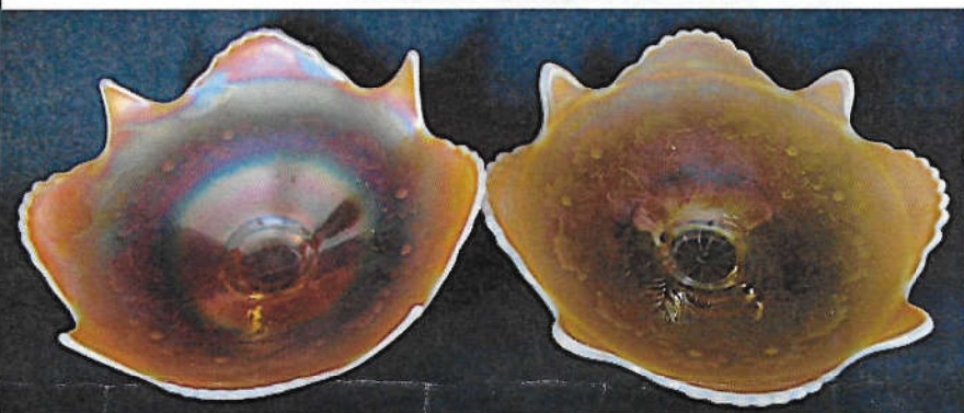
Above pictures from Barb Chamberlain's Article "Western Daisy" Page 16