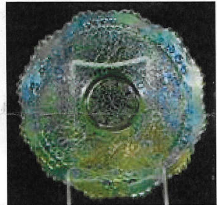
Leaf Chain 7" plate in ice green – only one known, we picked this out as the neatest piece in the ice green display at HOACGA last year, and didn't know it was Joyce's!