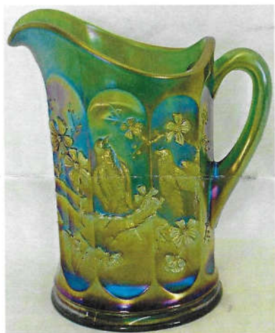
Singing Birds water pitcher in emerald green – this is screaming along with the Rose Show.