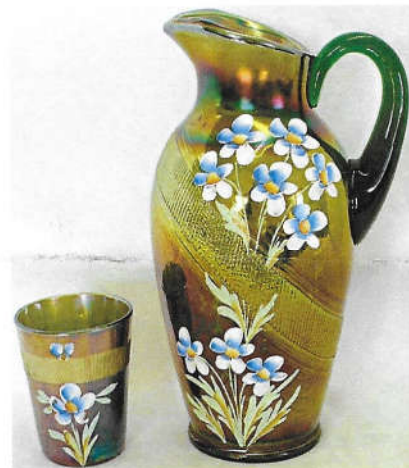
Enamelled Forget Me Not Banded Drape tankard pitcher & tumbler in green – this is just darn pretty.