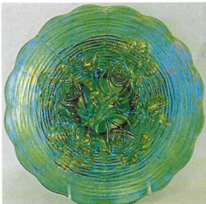
Rose Show 9" plate in emerald green – this just screams green!

Below are examples of the fabulous emerald green and green pieces from the Seale collection: