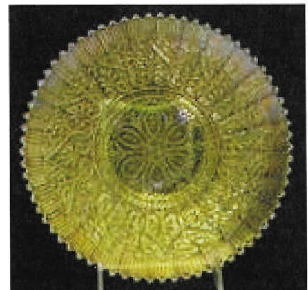
Hearts & Flowers 9" plate w/ribbed back in lime green, very rare and pretty.