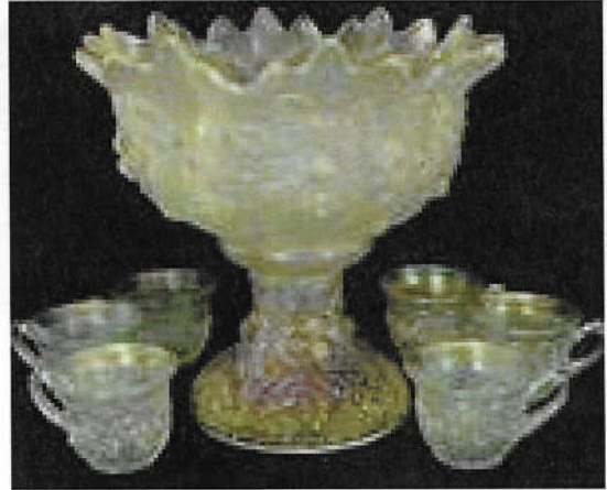
Acorn Burrs 8 pc. punch set in white – highly desirable and super.