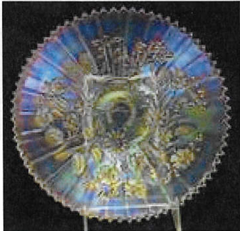
Good Luck 9" plate w/ribbed back in white – extremely rare with super irid.

This month we are sampling white, ice green and lime green pieces from the Seale collection.