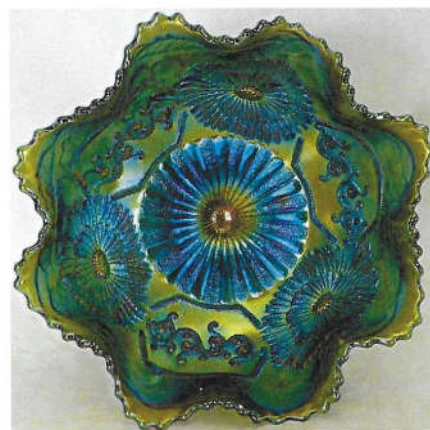
Mikado ruffled compote – emerald green – extremely hard to find in green plus this is a showstopper.