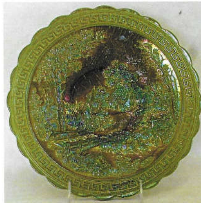
Homestead Chop plate in emerald green – emerald at its finest.