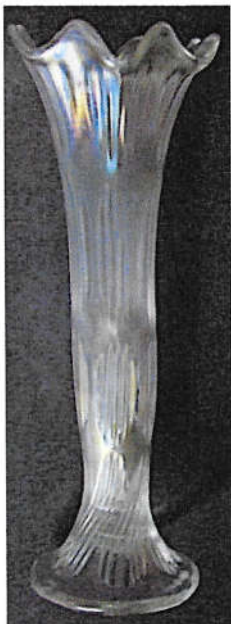
DIAMOND & RIB By Barb Chamberlain See Article on Page 3