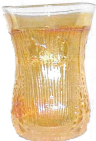
Moon & Stars