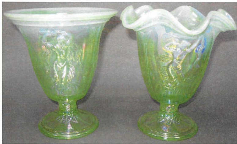
DANCING LADIES VASES Brent Mochel's Article, Page 17