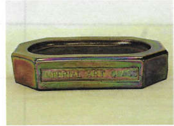
Part of the Morgan collection to be Auctioned at the 2011 HOACGA Auction See Seeck Auction Article, Page 5