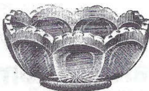
No. 3935A—4 1/2 in. deep berry. hand finished. packed 25 dozen in barrel. barrel lots, $0.33 per doz. smaller lots, 0.36 per doz.