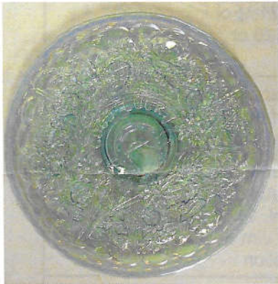
HOACGA 2011 Souvenir See Article Page 7