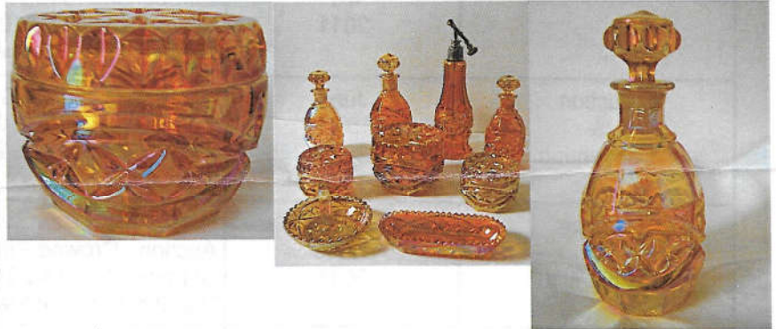
Double Diamonds Article By Barb Chamberlain, Page 14