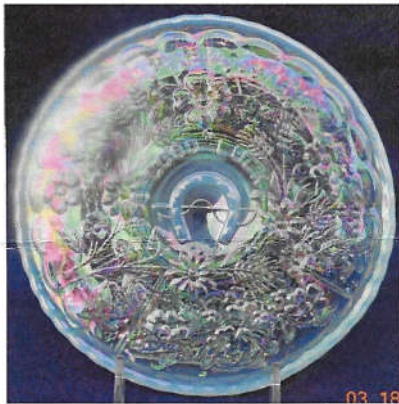
HOACGA 2011 Souvenir See Info Page 9