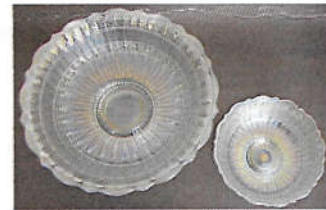
Scale Band Article By Barb Chamberlain, Page 16