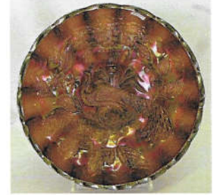
Part of the Morgan collection to be Auctioned at the 2011 HOACGA Auction See Seeck Auction Article, Page 5