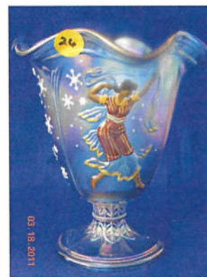
Dancing Ladies Vase