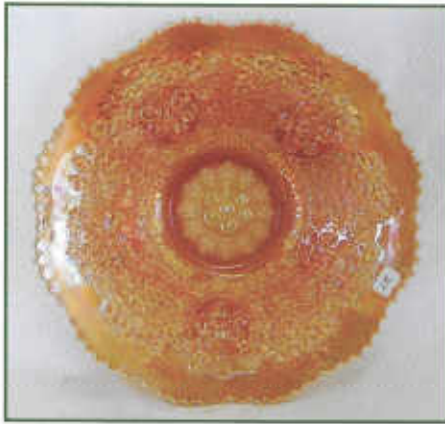
___ 317. Cherry Chain chop plate - marigold - dark & super, hard to find