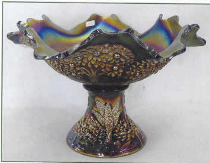
___ 254. Orange Tree whimsy ruffled punch bowl & base - blue - extremely rare to find in this shape, very small eraser size bruise on inside of bowl

___ 255. Orange Tree ruffled punch bowl & base - blue - very nice