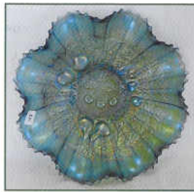
___ 108. Stippled Three Fruits ruffled bowl w/ ribbed back - sapphire - another wonderful piece of glass