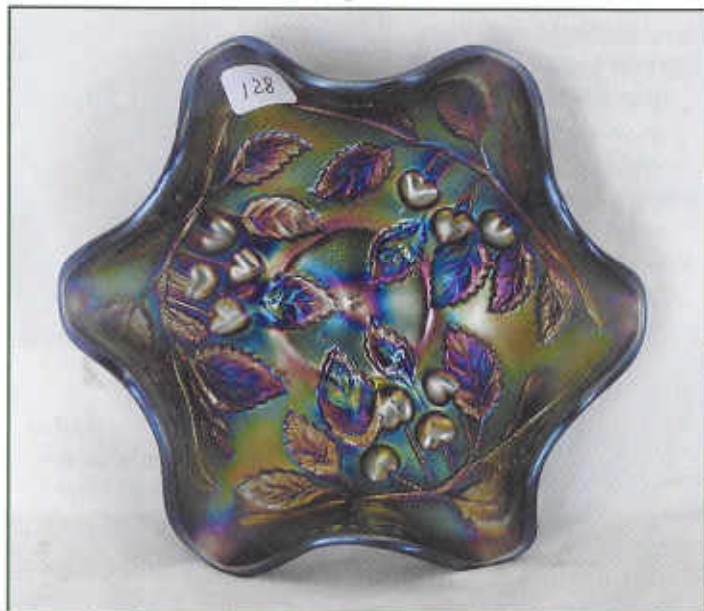
___ 128. M'burg Hanging Cherries ruffled sauce - blue - rare color, has pretty satin irid.