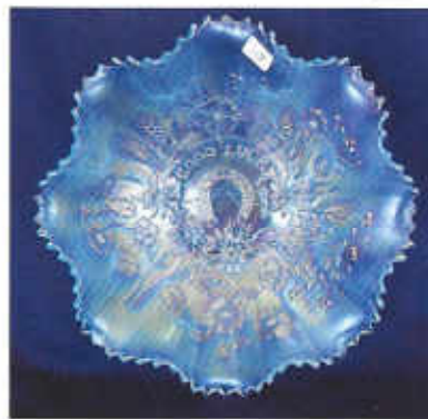
___ 118. Good Luck ruffled bowl w/ribbed back - ice blue - dark color w/pretty irid., rare piece