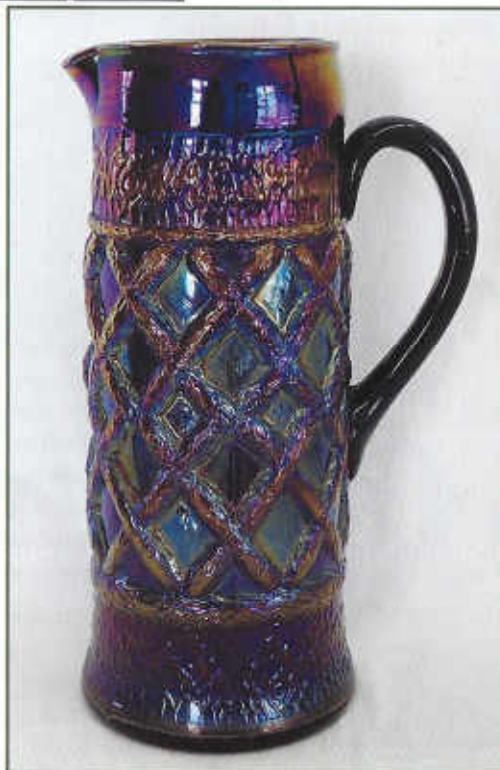
___ 107. Grapevine Lattice tankard water pitcher - marigold - nice