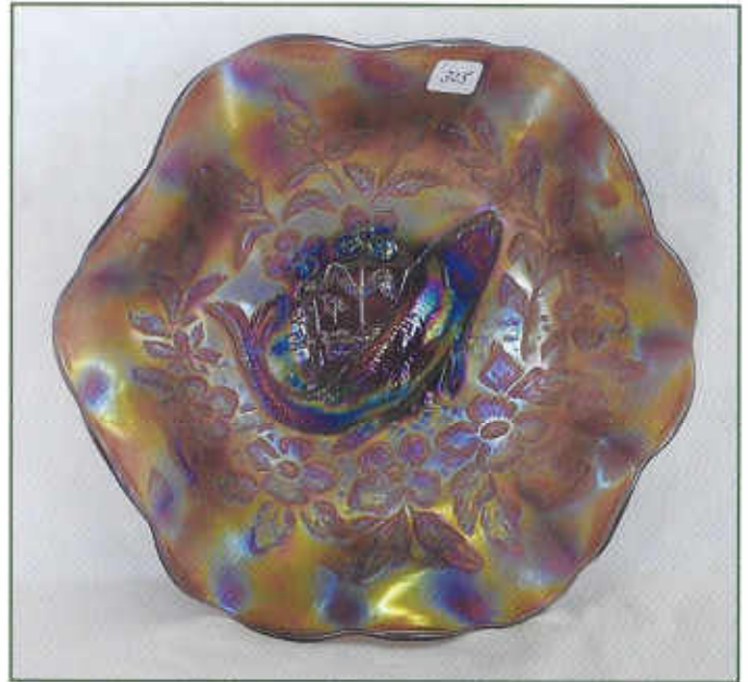
___ 328. Memphis 12" chop plate - crystal - not Carnival Glass