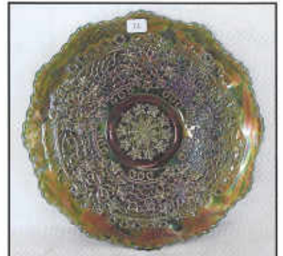
___ 75. Leaf Chain 9" plate - pastel marigold - pretty w/lots of pinks and yellows