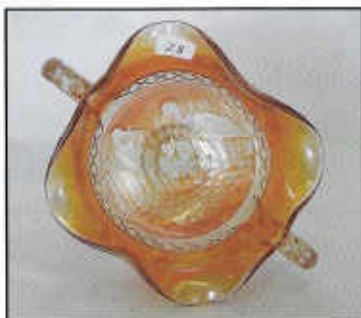
___ 28. Stork & Rushes w/Lattice Band ftd bonbon- marigold - I have never seen this before, did not know this existed! chip on base