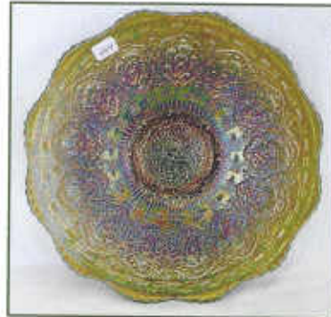
___ 264. Persian Medallion 9" plate - green - very rare plate & pretty, not more than a handful known

___ 265. Persian Medallion 9" plate - white - another rare & pretty plate ___ 266. Windmill 8" round bowl - emerald green - scarce color, pretty