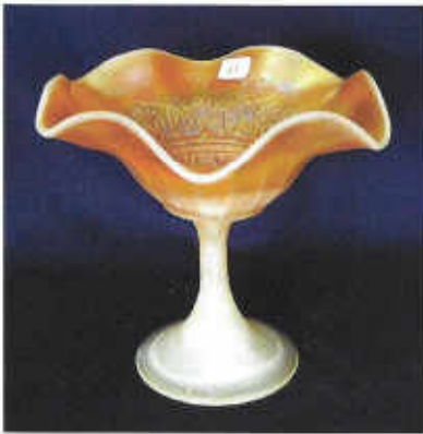
___ 61. Hearts & Flowers ruffled compote - marigold on custard - super pretty & very rare, as nice as they get