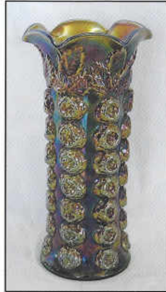
___ 92. M'burg Rose Columns vase - green - super pretty example, very rare & highly desirable