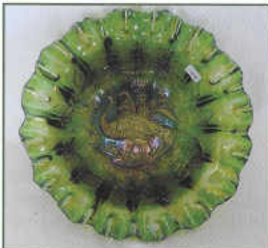
___ 136. Fenton's Vintage 10" ftd whimsy chop plate - blue - extremely rare, made from the fernery