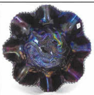
___ 29. Farmyard 8 ruffled bowl - purple - super rare & nice