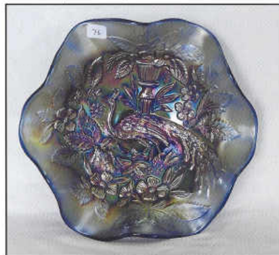
___ 76. M'burg Peacock at Urn Mystery bowl - blue - super rare color, satin & pretty