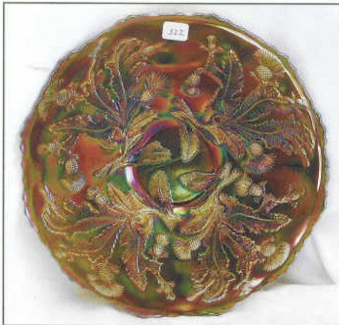
___ 322. Thistle 9" plate - green - super pretty, rare plate