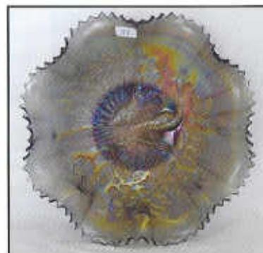
___ 36. Peacocks ruffled bowl w/ribbed back - aqua - another scarce color, very pretty