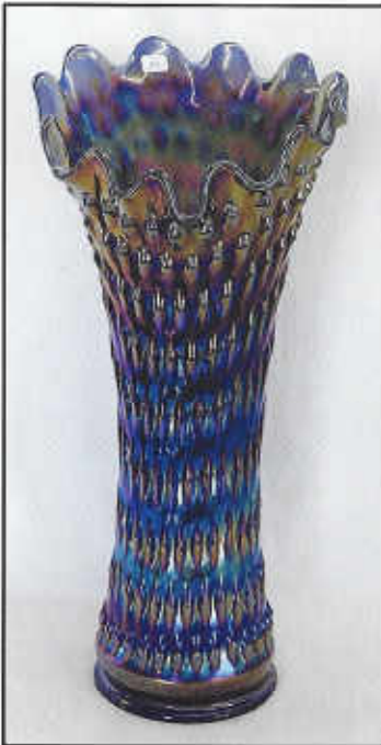
___ 83. Rustic 20" funeral vase w/plunger base - blue - super pretty & very scarce