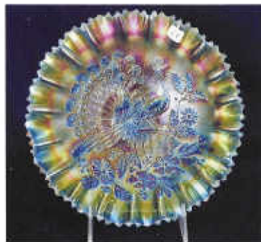
___ 27. Stippled Peacocks PCE bowl w/ribbed back - aqua opal - fabulous irid. on this extremely rare bowl, especially when stippled, (was super hard to photo and is much nicer than pics)