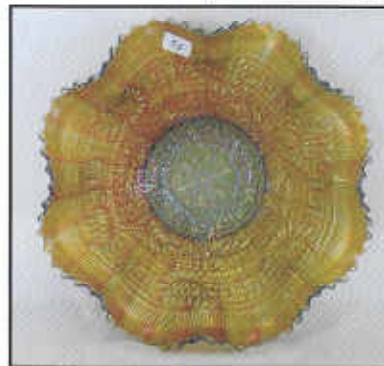
___ 98. Embroidered Mums ruffled bowl w/ribbed back - amethyst - super pretty