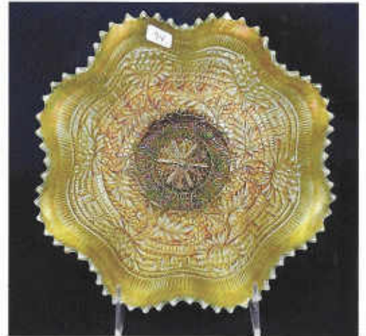
___ 95. Embroidered Mums ruffled bowl - aqua - rare color, nice