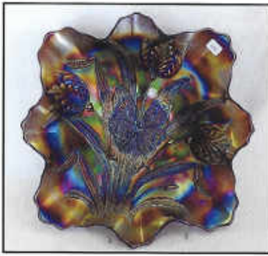
___ 100. Butterfly & Tulip ftd square shaped bowl - purple - a beauty for this collector's classic