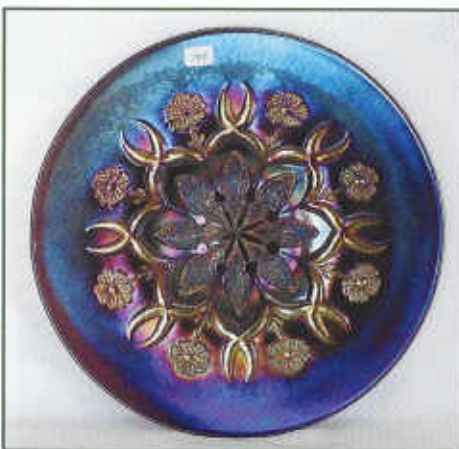
___ 146. Wishbone tri-cornered ftd bowl - marigold - also scarce & nice