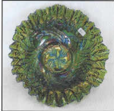
___ 82. M'burg Whirling Leaves crimped edge bowl - amethyst - slightly egg shaped, radium & pretty, a great pair