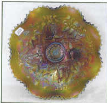
___ 250. Wishbone ftd ruffled bowl - sapphire - super pretty for this rare color