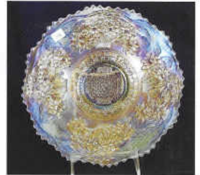
___ 117. Orange Tree w/ Trunk 9" plate - white - irid. is fantastic