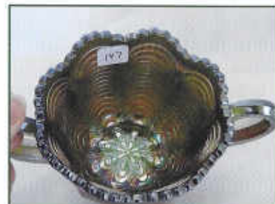
___ 147. Peacock Tail breakfast sugar bowl - green - only one I have seen, very cool piece