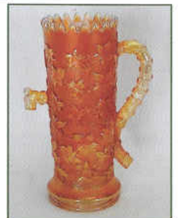
___ 124. N's Town Pump - marigold - dark & pretty from top to bottom, scarce