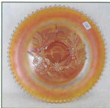
___ 138. N's Good Luck prototype 9" plate w/ BW back - marigold - extremely rare, especially in the plate, believed to be only one or two known, similar pattern to the Jockey Club advertising piece, super nice