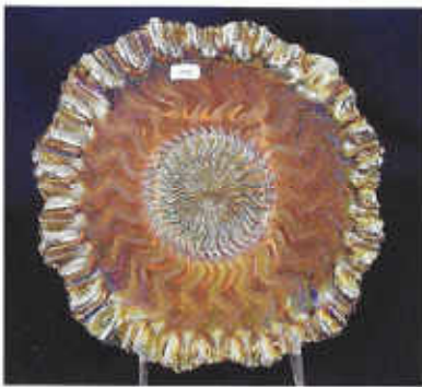
___ 105. M'burg Zig Zag square shaped crimped edge bowl - marigold - radium, dark & beautiful, rare