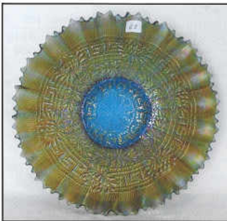
___ 65. Embroidered Mums PCE bowl w/ribbed back - sapphire - super rare color, highly desirable