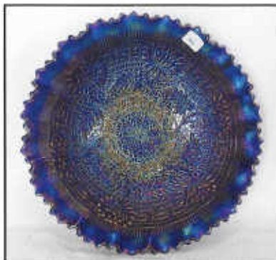
___ 67. Peacock at the Fountain punch bowl & 6 cups - white - rare punch set, missing base