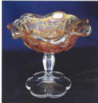
___ 104. N's Grape & Cable lg size ftd orange bowl - purple - very pretty