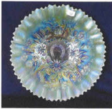
___ 77. Drapery Variant 9" vase - sapphire - pretty irid. on this scarce color